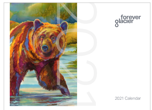
2021 Wall Calendar